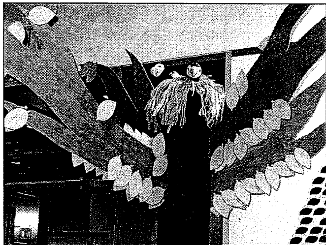
Our goal is to purchase 500 trees, a TBI grove. Our tree has already begun to show growth. Please help us to make this tree green once again.

As of March 1, members of TBI (including many students in Religious School) have purchased more than 25% of a grove! This is a great start. Let's keep the momentum going!